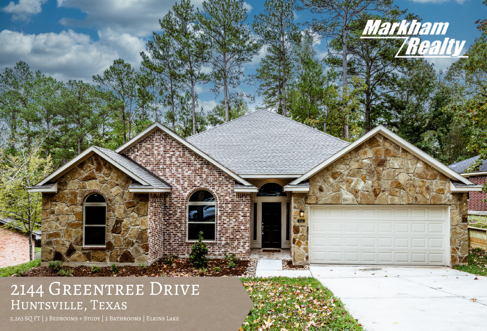
2144 GREENTREE DRIVE HUNTSVILLE, TEXAS 2,263 SQ FT | 3 BEDROOMS + STUDY | 2 BATHROOMS | ELKINS LAKE